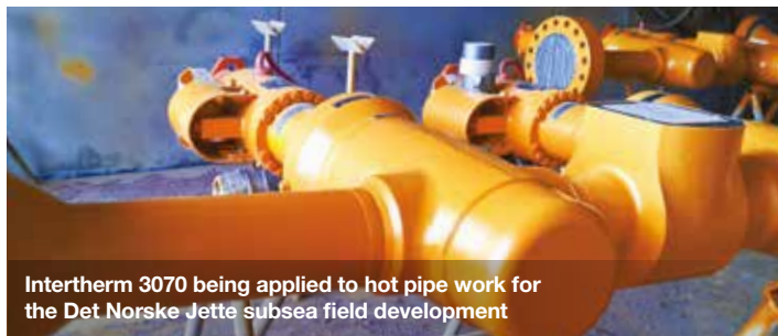
Intertherm 3070 being applied to hot pipe work for the Det Norske Jette subsea field development

Extensive testing has been carried out to demonstrate the high temperature performance capabilities of Intertherm 3070. This includes pre-qualification to Norsok M-501 Edn. 6 System 7C at 175°C (350°F) steel temperature. Long term performance is also backed up by independent immersion testing at temperatures above 185°C (375°F) carried out over extended time durations.